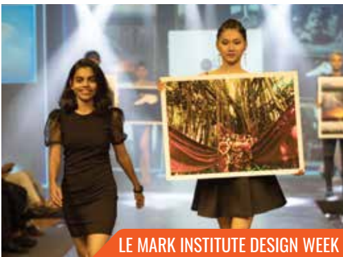
LE MARK INSTITUTE DESIGN WEEK