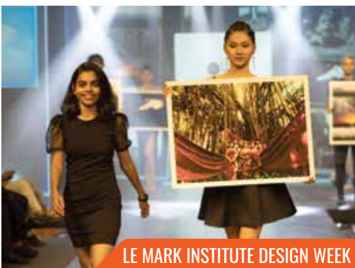
LE MARK INSTITUTE DESIGN WEEK