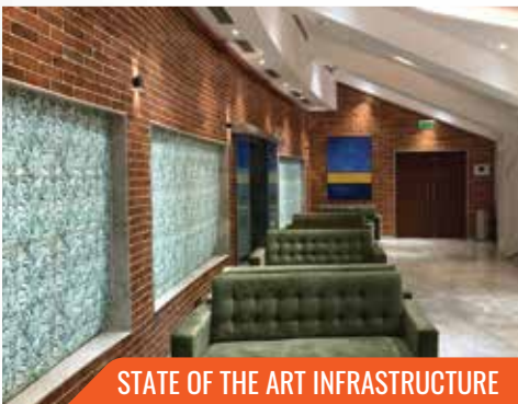
STATE OF THE ART INFRASTRUCTURE