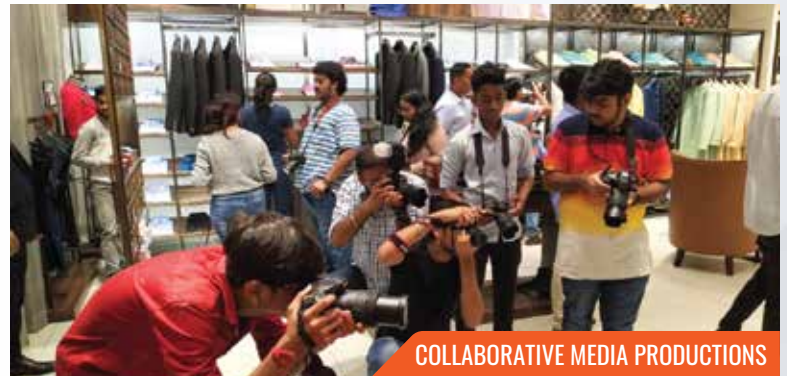
COLLABORATIVE MEDIA PRODUCTIONS