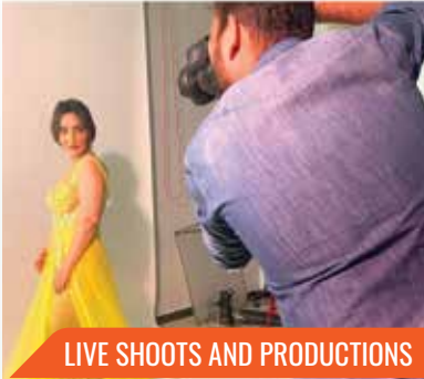
LIVE SHOTS AND PRODUCTIONS

Fueling creativity and innovation through immersive, hands-on learning. Preparing you with real-world skills for a successful professional journey.