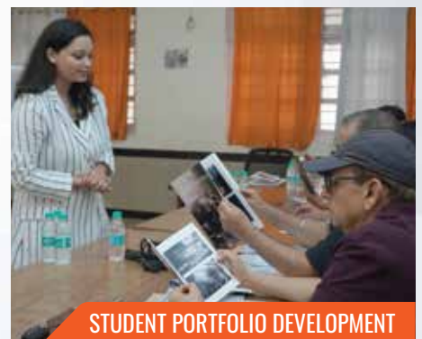
STUDENT PORTFOLIO DEVELOPMENT