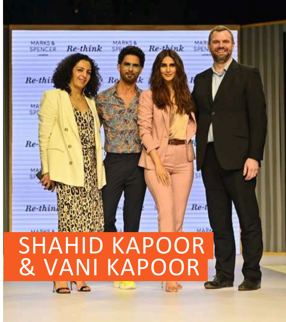
SHAHID KAPOOR & VANI KAPOOR