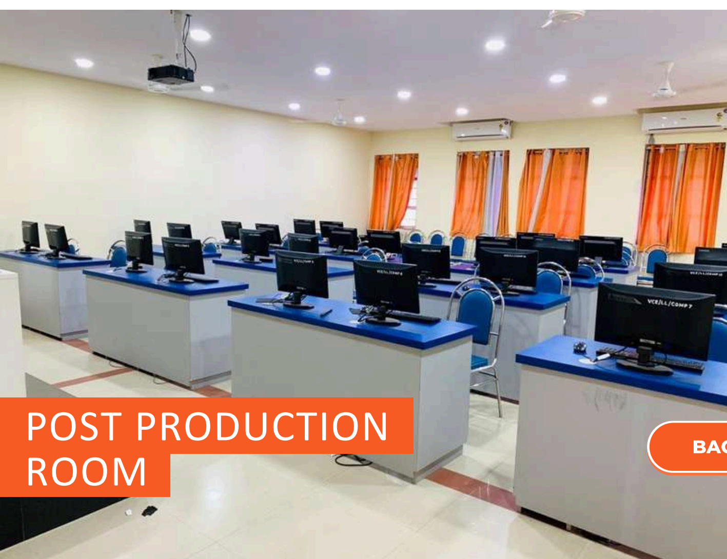
POST PRODUCTION ROOM